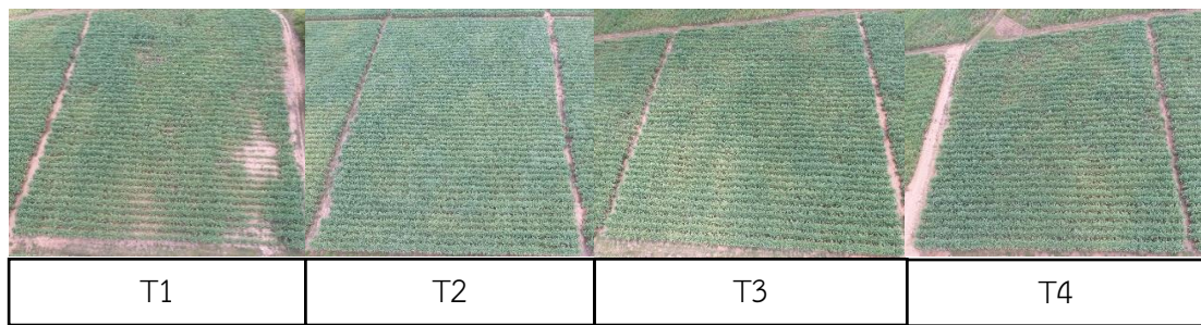
Attached Figure 4 Effects of irrigation method in loamy sand soil (LS) at 7 MAP