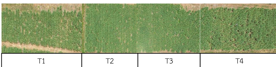
Attached Figure 3 Effects of irrigation method in sandy clay loam soil (SCL) at 7 month after planting (MAP)