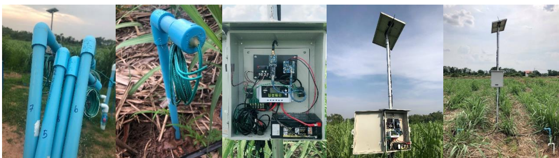
Attached Figure 2 Sensor installation.